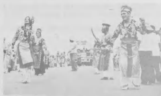
The Hmong of Laos (Esso Club)